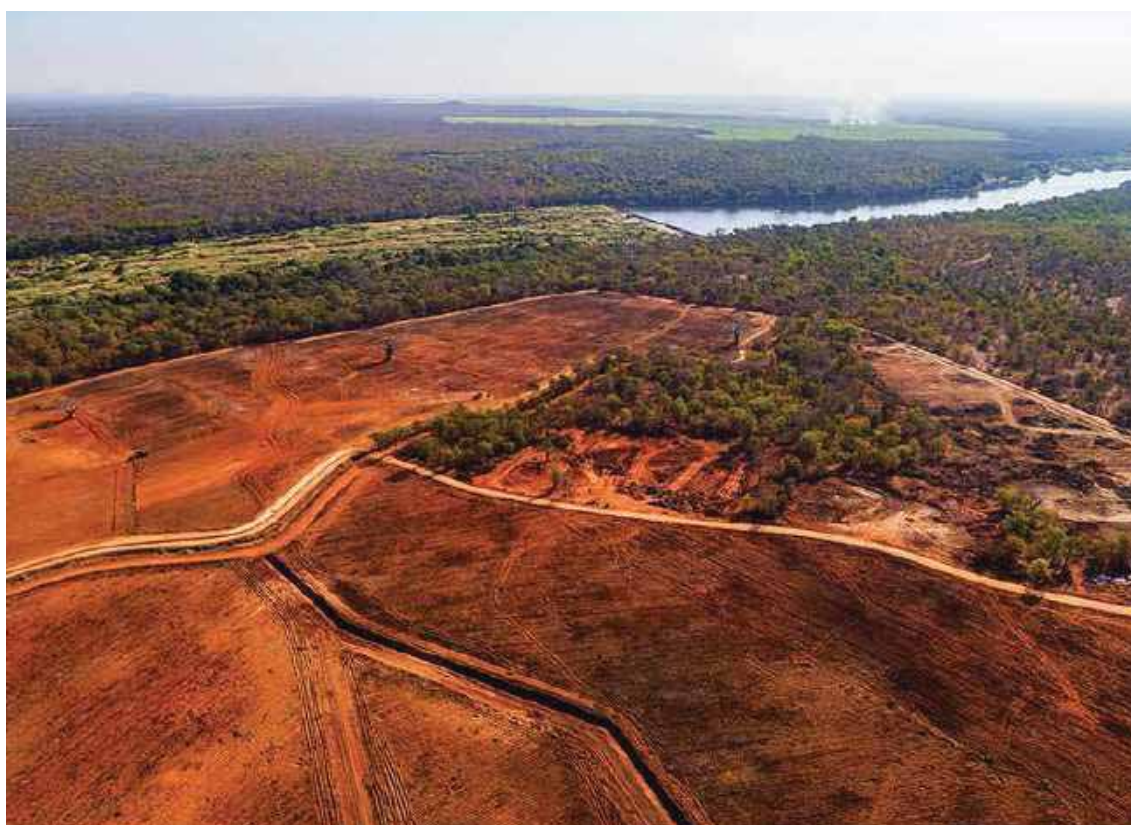
Project Kilimanjaro - new cane fields developed