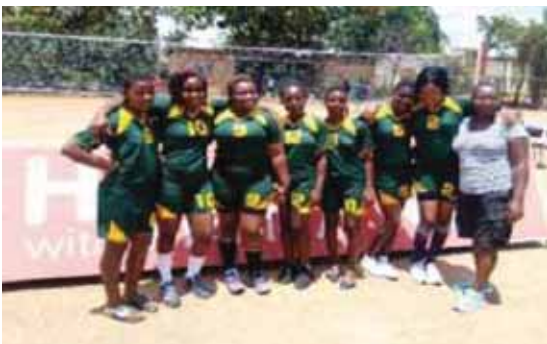
Women's Volleyball Team