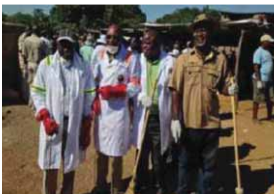
Mabanana Markets - Chiredzi