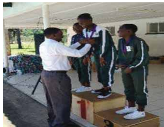
Swimming Team completing at Province and National Championships and National Medalists