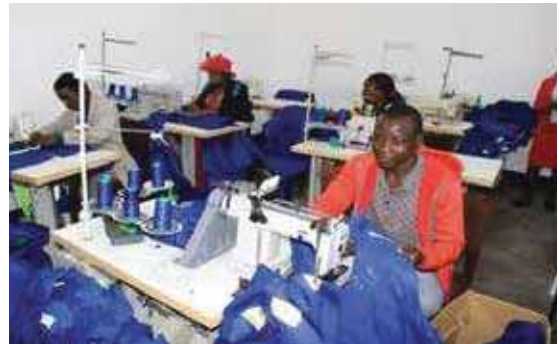
Vavasati Ventures PPE Production line

Vavasati Ventures, a consortium of 8 local women who were facilitated by the Company to access concessionary loan funding from banks on the back of a supply contract has managed to continue operating notwithstanding the harsh economic environment. The Company has an installed capacity of 25 000 work suits per year and during 2018/19, it produced 13 000 work suits valued at approximately RTGS$385 000 and at peak employed an average of 42 employees of which 80% were female. It injected approximately RTGS$110 000 per year into the Chiredzi Town's economy through employment benefits to its employees.