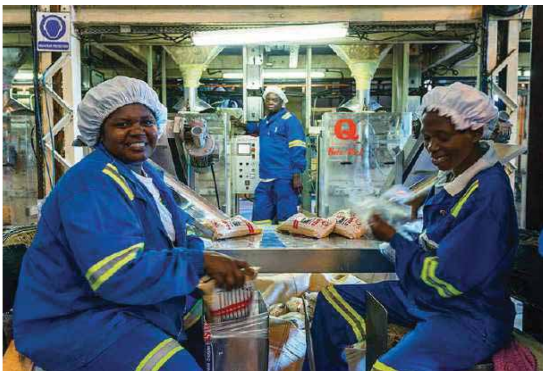
Sugar Packing Station

arising from a failure to use, or misuse of, reliable information that: (a) was available when financial statements for those periods were authorised for issue; and (b) could reasonably be expected to have been obtained and taken into account in the preparation and presentation of those financial statements. Such errors include the effects of mathematical mistakes, mistakes in applying accounting policies, oversights or misinterpretations of facts, and fraud. A prior period error is corrected by retrospective restatement except to the extent that it is impracticable to determine either the period-specific effects or the cumulative effect of the error.