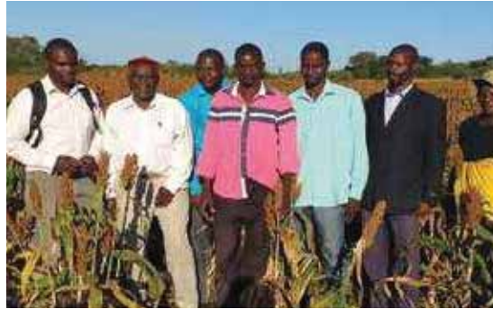
Sorghum Field Day at Nyahombe, Chivi District, May 2019

livestock beneficiation value chain in which the local farmers also participate.