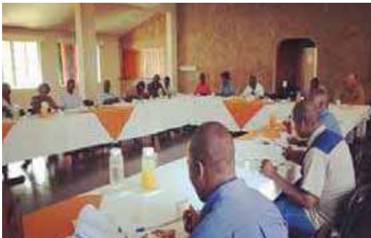
Manager training session on Wellness at HVCC sponsored by NAC

In recognition of the threat posed by HIV/AIDS, the Company has prioritized the management of the disease and committed to the WHO targets 90:90:90. This has resulted in aggressive HIV/AIDS awareness, testing and care campaigns with:-