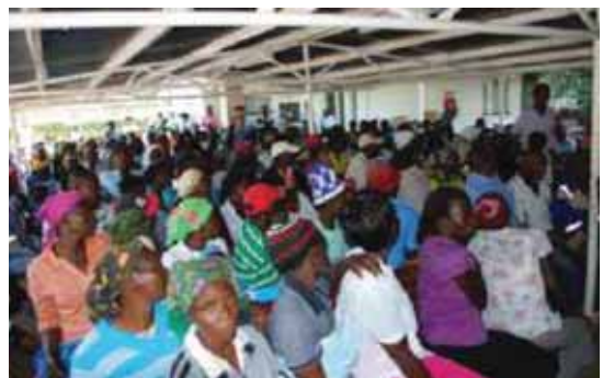
Patients waiting to be seen at the Medical Centre