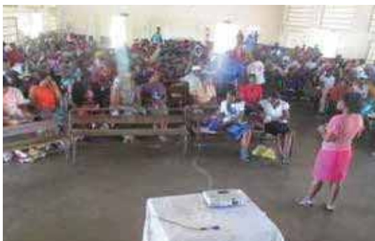
Ladies Health Day With Awareness training on Ca Cervix and HPV vaccine

Furthermore, cancer screening was provided to female employees and the community.