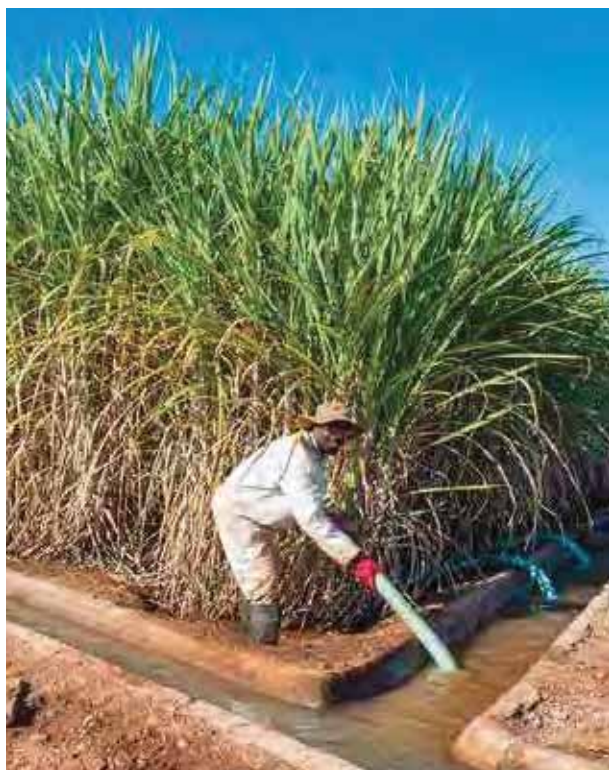
Applying water to the cane crop