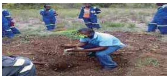
Pictures showing 2018 Tree Planting Day activities in Chivaraidze Village

In the 2018/19 financial year, the organisation used about 33 tons of firewood for industrial purposes (start-up of mill boilers) and about 517 tons for domestic use. To ensure sustainability of the local forestry plantations and the natural veld, a total of 1 400 indigenous trees and 8 008 exotic trees were distributed for planting within the Estate and its surrounding communities.