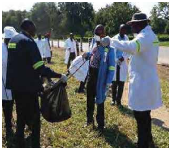
At Dulys Market - Triangle