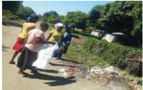
Hippo Section 5