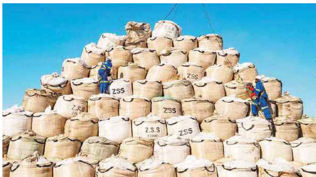
Sugar stacking before dispatch