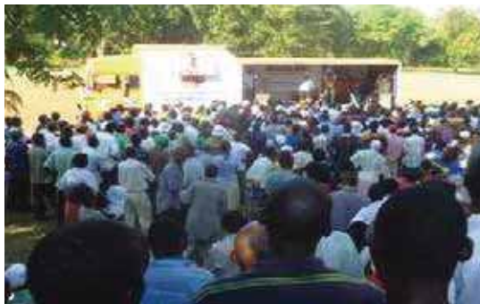
Malaria Awareness campaign

In 2018, the Company received Insecticide Treated bed nets from the National Malaria Control Programme (NMCP) and 11 800 of these nets were distributed to employees and the community.