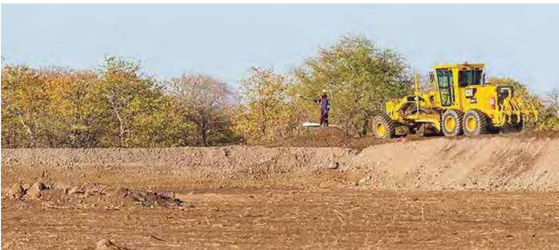
Overnight storage dam construction

Tongaat Hulett was identified by the ZNCC as having the best Enterprise Development Project in Masvingo and Mutare Provinces. The Award was presented at the ZNCC Provincial Conference held at Golden Peacock in Mutare in August.