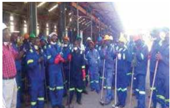
Mill Boiler Shop