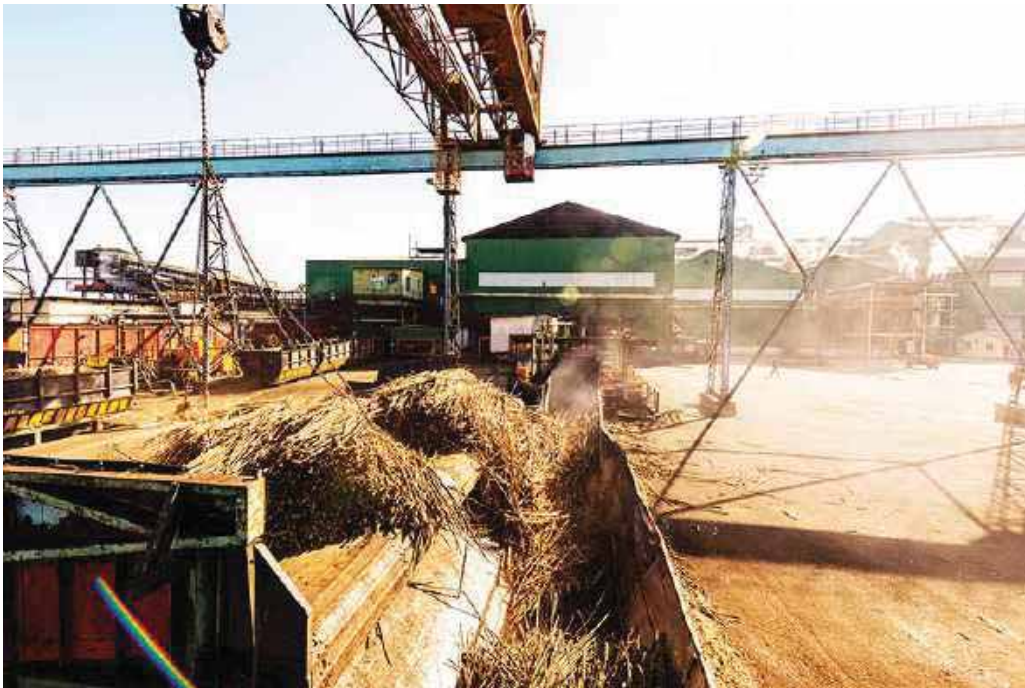
Cane dropping onto the carrier system

Included in the private farmers receivable balance ( inclusive of the company's 50% share of Mkwesine), is a total gross amount of RTGS$2 7671 922 (2018: RTGS$5 236 992) which is recoverable from private farmers for overpayments made in respect of Division of Proceeds (DoP). This amount is as a result of a retrospective adjustment for the periods 2014/15 and 2015/16, from an interim ratio of 82.65% : 17.35% to a revised ratio of 77% : 23% in favour of the private farmers. The adjustment was effected in the 2016/2017 financial year. The adjustment follows a directive issued by the Ministry of Industry and Commerce on 23 November 2016 per recommendations of the independent consultant (Ernst & Young). The directors are of the view that the full amount outstanding as at 31 March 2019 is recoverable within the remaining year. Impairment for the receivable amount has been treated in accordance with IFRS 9.