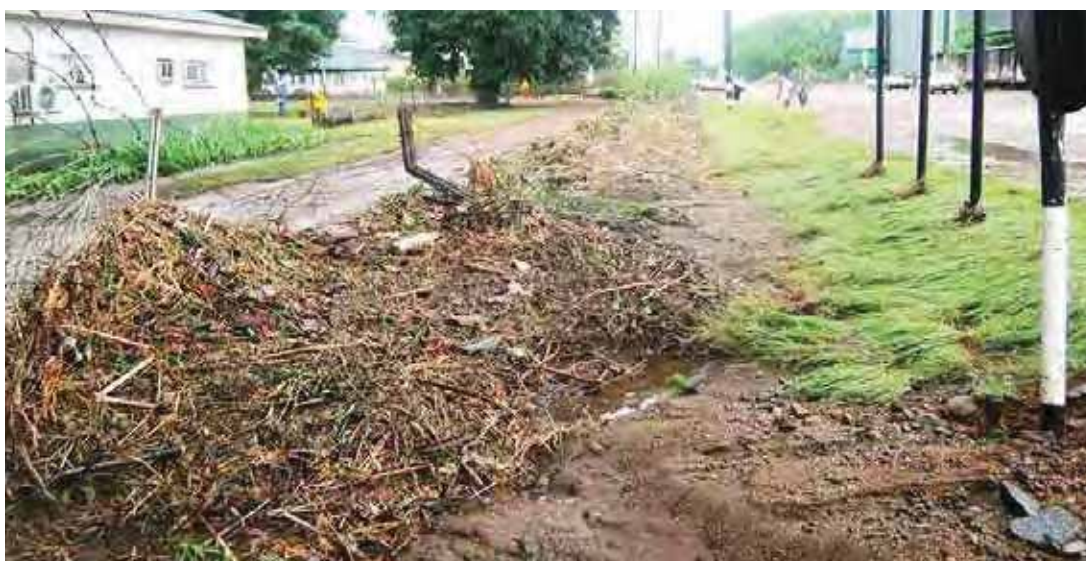
Flood storm damage - February 2019

Long-term borrowings and current liabilities excluding deferred taxation.