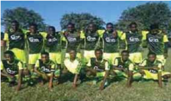
U20 Soccer Team