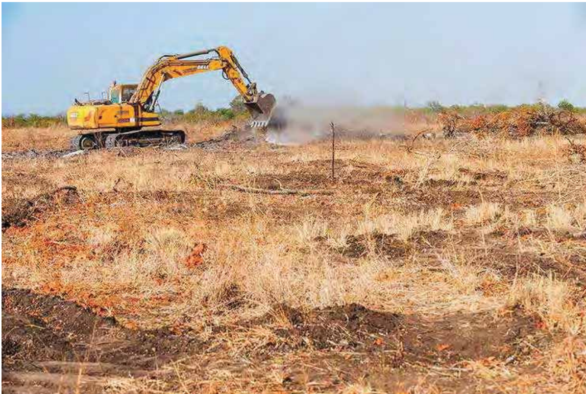
Bush clearing under Project Kilimanjaro