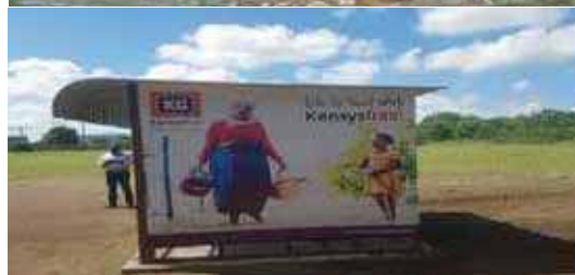
LP Gas outlets