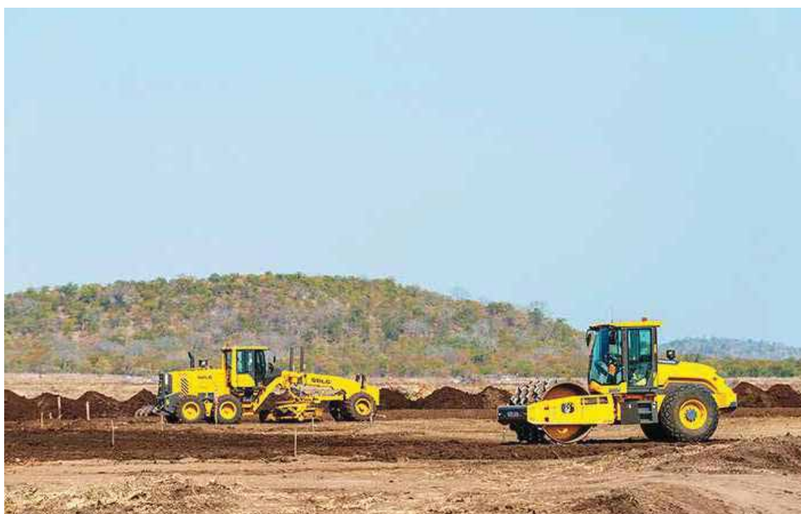
New development under Project Kilimanjaro