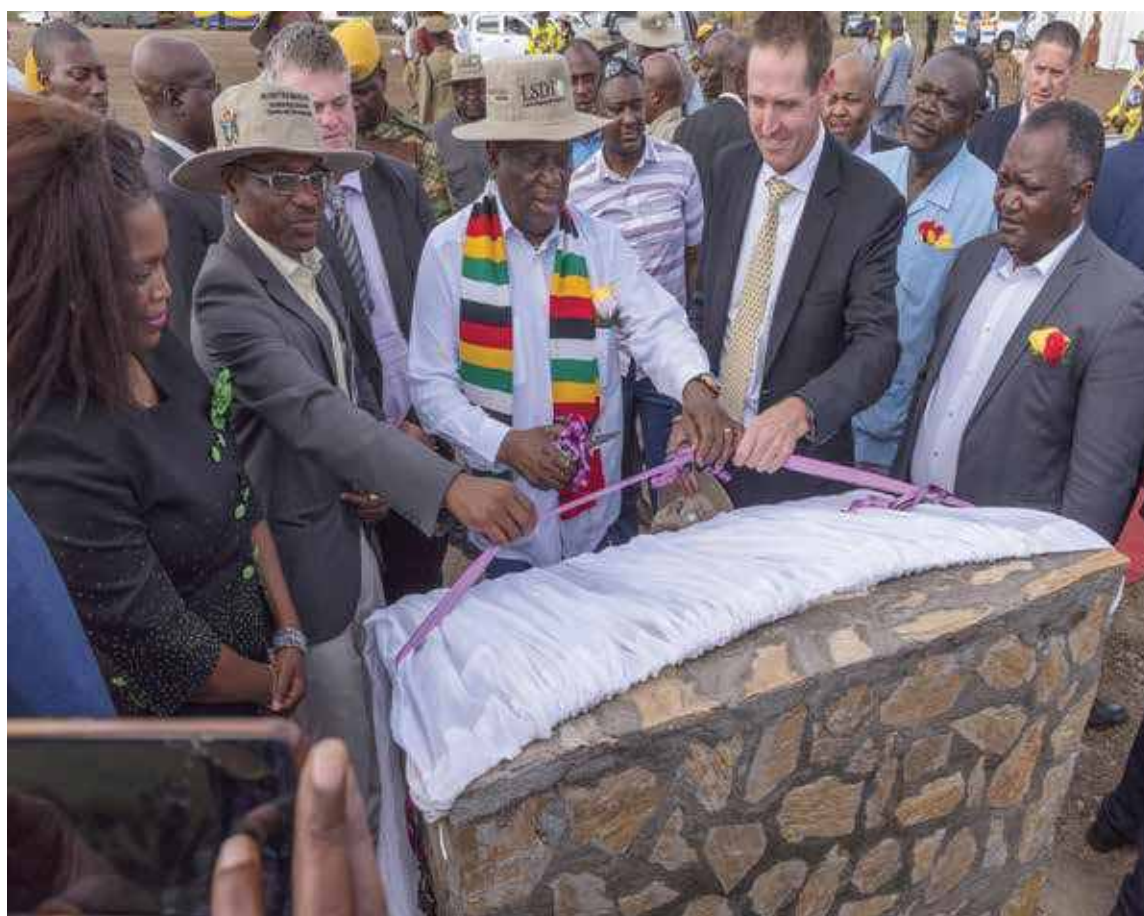
Project Kilimanjaro-Official launch