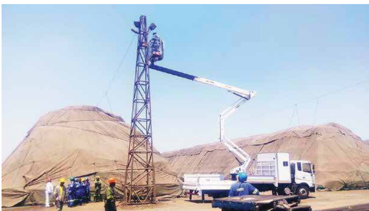
Working at heights challenge addressed