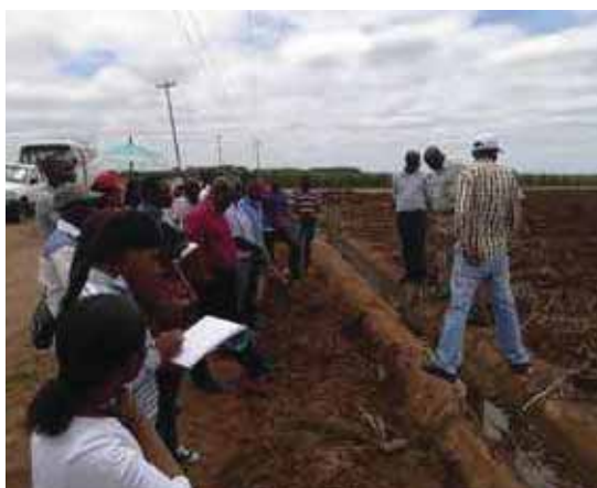
Trainee Section Managers undergoing induction

To strengthen the middle management talent pool and "B" teams in all disciplines, 10 Graduate Learners, 5 of whom are female, commenced a two year learnership programme in January 2019 in seven disciplines namely, Engineering, Agriculture, Finance, Human Resources, Safety, Strategic Sourcing and Transport and Logistics. The learners went through an intensive onboarding three week programme before commencing learnership. Below is a picture of the learners during the onboarding process.