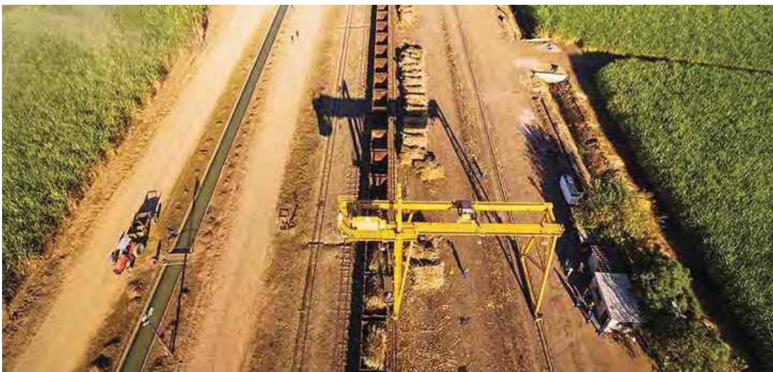
Rail loading zone

Company results have not been shown here and in the notes to the financial statements for reasons explained in note 31.