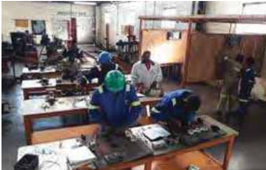
Apprentices taking practical lessons in the workshop